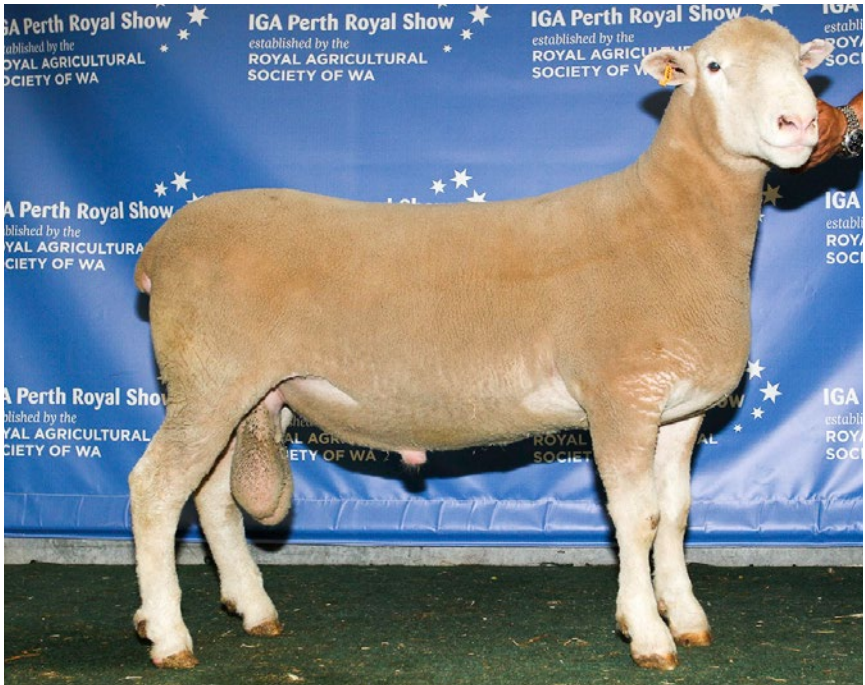
IMG 9323 is Hillcroft Farms 479-13 Leading sire at Bruan Poll Dorsets. Purchased by Meat Elite Australia for $31,000 a world record price.