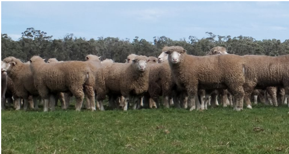
Sale rams prior