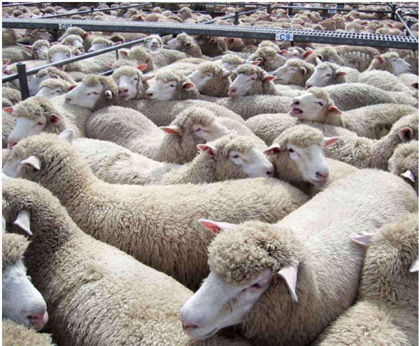
IMG Bruan Poll Dorsets are Sucker lambs sired by Bruan Poll Dorset rams. Average weight 65kg