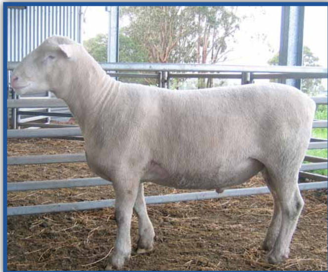
BRUAN 116/09 Sire: Pollambi 2025-07 Semen Available.