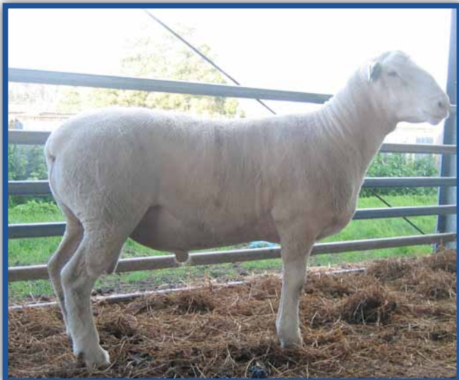
BRUAN 386/09 Sire: Pepperton 352-07 Semen Available.