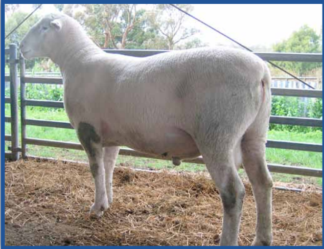
BRUAN 417-09 Sire: Bruan 108-07