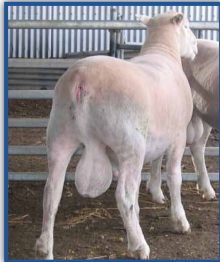
BRUAN 359/09 Sire: Pepperton 352-07