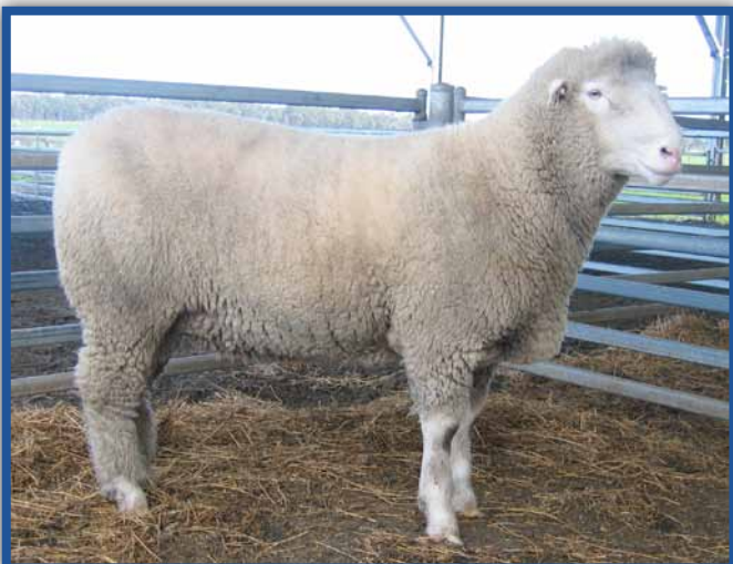
BRUAN 26-09 Sire: Ohio 72-06