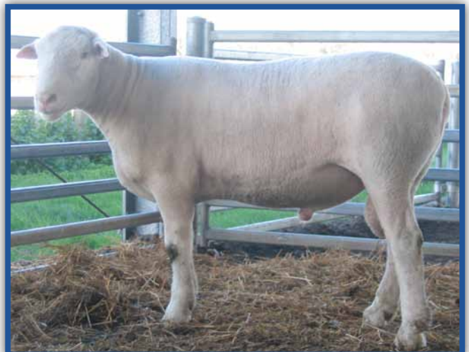
BRUAN 181/09 Sire: Bruan 58-08